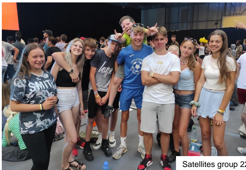
Satellites group 22