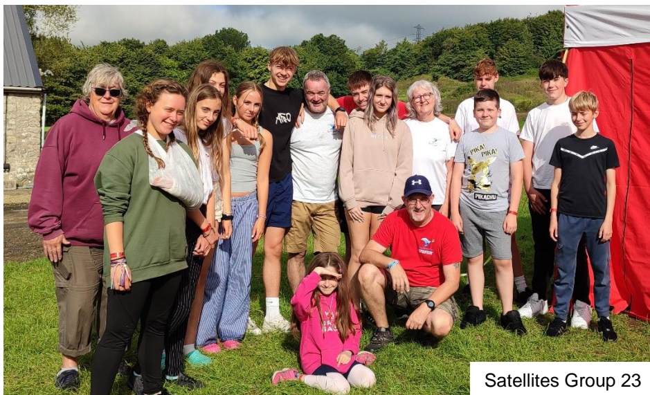
Satellites Group 23